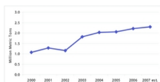
Navios Uruguay Annual Throughput Volumes

Navios is currently in negotiations with significant existing and new customers, who have expressed high levels of interest in entering in long-term business relationships with the company based on the growing Uruguay